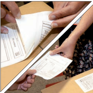
Peel and apply a delivery label leaving the corresponding invoice (or picking list, return policies and procedure, customer survey, etc.) printed on its backing paper.